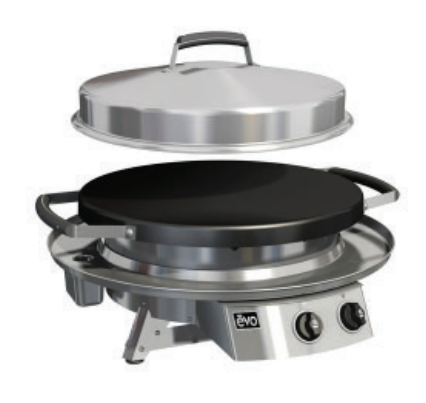
Professional Tabletop Portable/ Gas Page 7