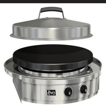
Affinity 25G Drop-in / Gas Page 5