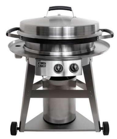
Professional Wheeled Cart Freestanding / Gas Page 6