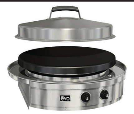
Affinity 30G Drop-in / Gas Page 4