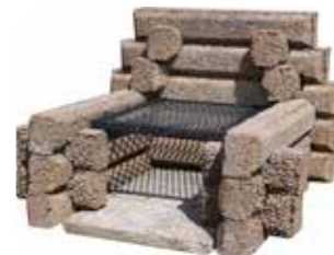
Pee Wee - Brown