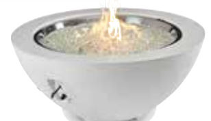
Cove White, CV-30WT