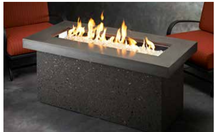
Key Largo w/ Midnight Mist Top