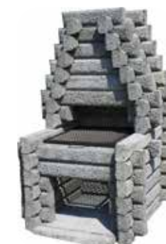
Senior (Available in Brown)