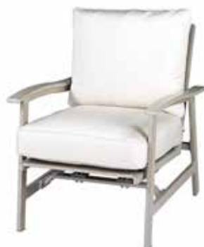
Deep Seating Chair 355091