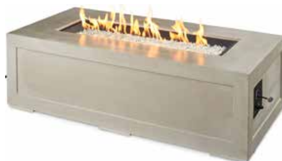
Linear Cove, CV-1242