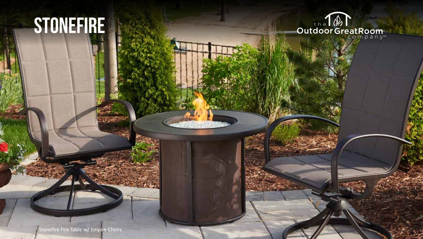
Stonefire Fire Table w/ Empire Chairs