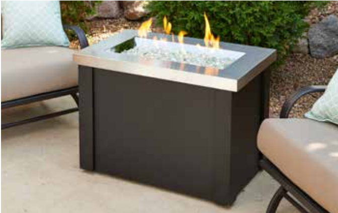
Providence w/ Stainless Steel Top and Black Metal Base PROV-1224-SS