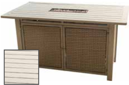
Adams Fire Bar 355021