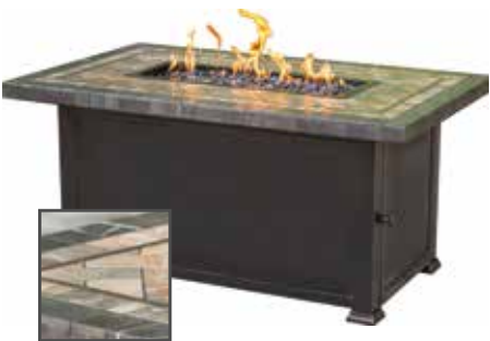
Rockwood Rectangle 355023