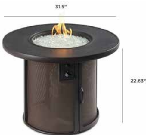
Stonefire Fire Table