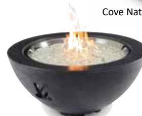
Cove Black, CV-30BLK