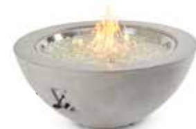
Cove Natural Grey, CV-30