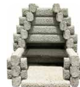
Parksite - Gray