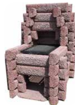
Junior with Chimney (Available in Gray & Brown)