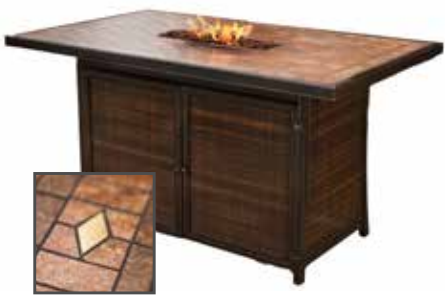
Saranac Fire Bar 355020