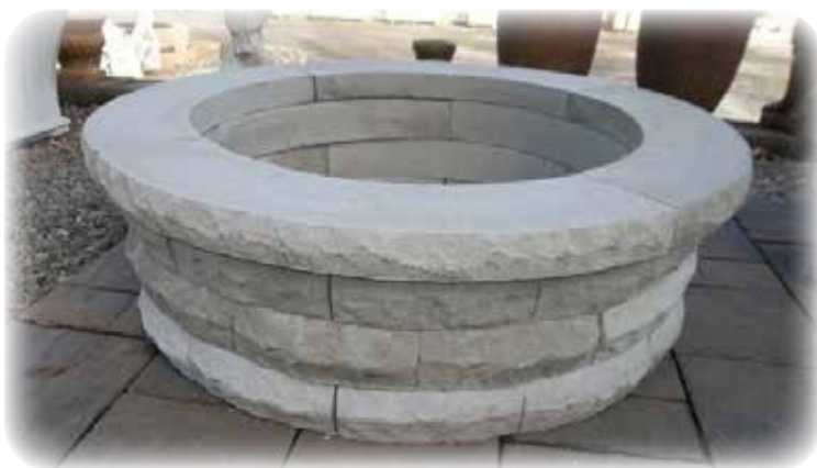
Precast Fire Pit, Gray