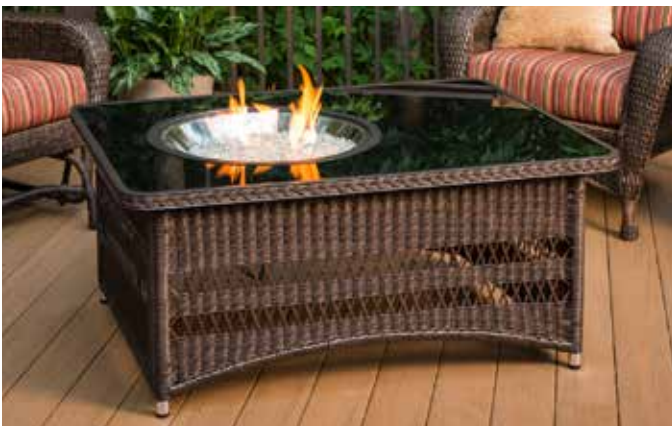
Naples Fire Table