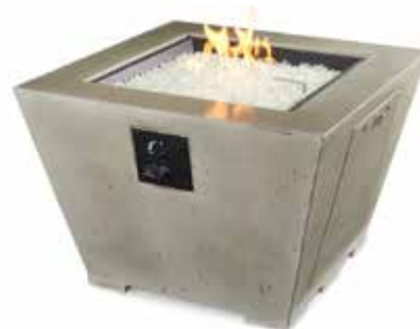
Square Cove, CV-2424