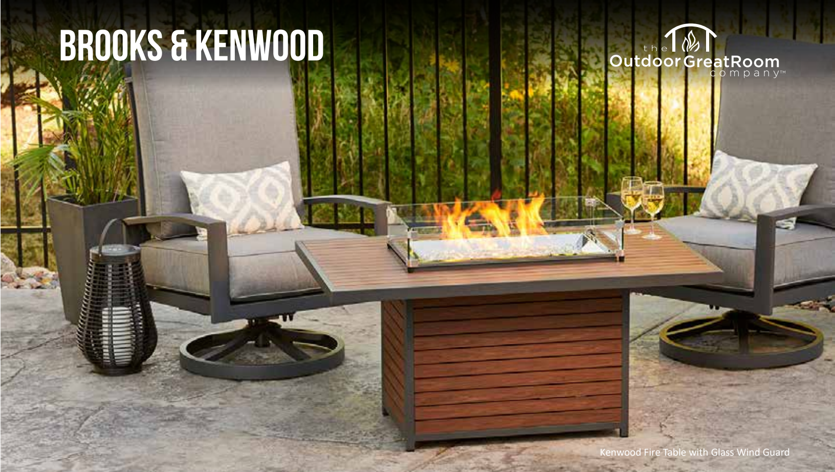
Kenwood Fire Table with Glass Wind Guard