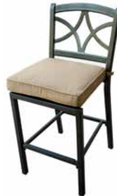
Adams Bar Stool