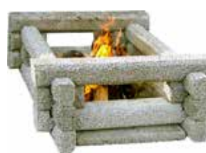
Firebox (Available in Brown)