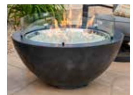
Glass Wind Guard