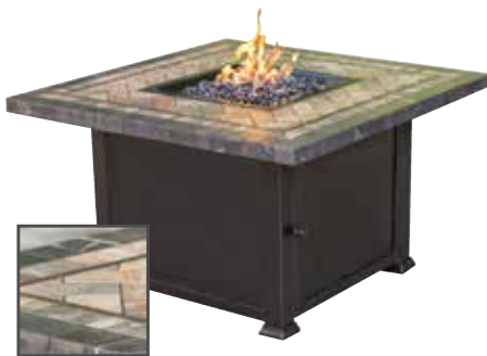
Rockwood Square 355022