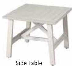
Side Table 355095

Inspired by the many lakes in the Northeast United States, The Lakewood Collection features a hand-brushed, whitewashed finish and contemporary clean lines that call for you and your guests to sit back and relax by the water or in the privacy of your own backyard. The lightweight, rust-free aluminum frames and premium, durable Sunbrella® fabrics ensure years of trouble-free comfort, and style.