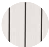
Hand Brushed Whitewash Finish