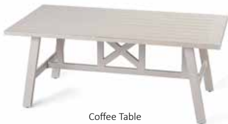
Coffee Table 355097