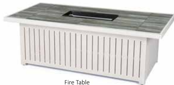
Fire Table 355013