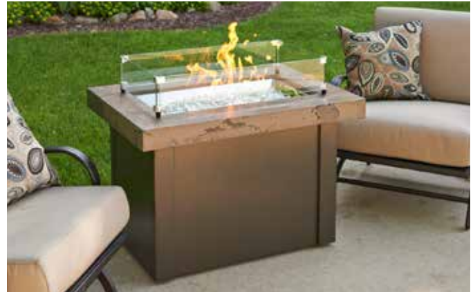
Providence w/ Marbled Noche Top and Brown Metal Base PROV-1224-MNB-K